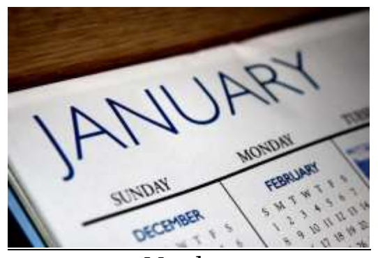
<u>Mondays</u> 11-12 p.m. Brew Crew-AA 1/6-Council Meeting 10 a.m.

<u>Tuesdays</u> 11-12 p.m. Brew Crew-AA 6:45-8:30 p.m. Power Up-Tae Kwon Do